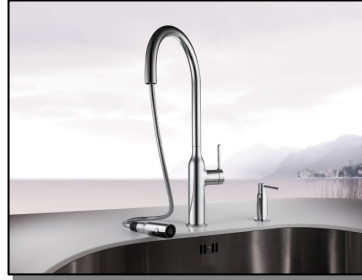
KWC SIN with highflex spring hose (left) and pull-down spray

FOR IMMEDIATE RELEASE CONTACT: KELLY COLDREN KWC AMERICA 678.334.2121 KCOLDREN@KWCAMERICA.COM